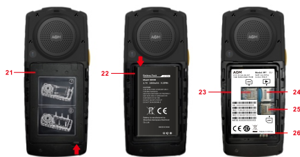
*Device photos may differ in colors or models on M7/M7 SE/M7 PRO

Features of the product and its accessories described herein rely on the software, phone internal memory and local networks, and may not be activated or may be limited by local network operators or service providers. Therefore, the descriptions herein may not exactly match the purchased product or its accessories. The manufacturer reserves the rights to change or modify any information or specifications contained in this manual without prior notice or obligation. The manufacturer is not responsible for the legitimacy or quality of any products that you may upload or download through this device including but not limited to text, images, music, movies, and non-integral software. Any consequences arising from the usage of the preceding products on this device is the responsibility of the user.